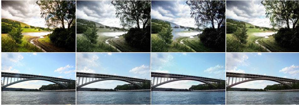
Figure 1: From left to right: each row includes a natural image taken from ImageNet [3] and three colorized images generated by the colorization algorithm proposed in [8], [13], and [7], respectively.

images, the left-most column is the original color images, and the remaining three columns are colorized images produced by three recent and advanced colorization algorithms (respectively with the name Ma [8], Mb [13] and Mc [7], from left to right), which take the grayscale version of the left-most column as input. It is indeed difficult to distinguish, with naked human eyes, which images are artificially colorized. Accordingly, distinguishing between natural images (NIs) and colorized images (CIs) has drawn increasing interest among the image forensics research community [6, 15].