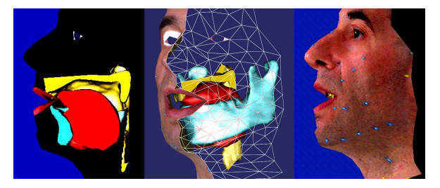
Figure 1: Examples of OFC display. The face, the jaw, the tongue and the vocal tract walls including the hard and soft palates can be distinguished when the skin is not represented.

Note finally the only experiment that we are aware of in speech therapy, where Fagel et al. [20] attempted to correct